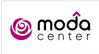
2-color over white