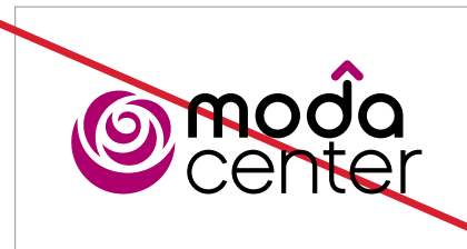
Don't rescale letters