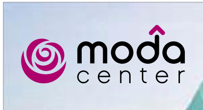
2-color over light colors or image