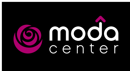
2-color reverse over black