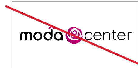
Don't rearrange logo elements