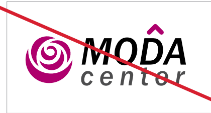
Don't change typeface