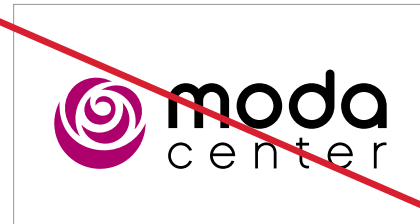
Don't remove the Moda arrow