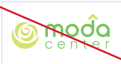
Don't apply off brand colors