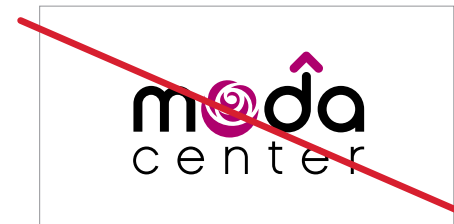
Don't repurpose logo elements