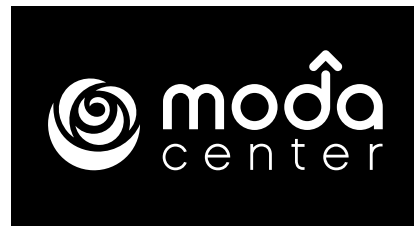
White over black