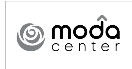
Grayscale over white