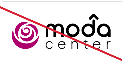
Don't change the Moda arrow color