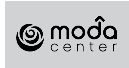
Black over 10%-50% value