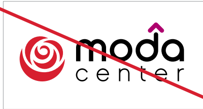
Don't change the symbol color