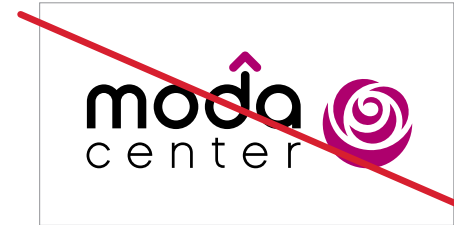
Don't reposition the symbol